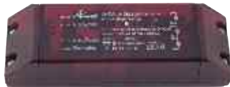
ATX35/105 Generous primary loop-in, loop-out facility removing the need for a junction box