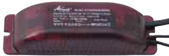
ATX20/60 Prewired Mains and secondary leads