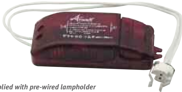
ATX60/AUTO Supplied with pre-wired lampholder Generous primary loop-in, loop-out facility removing the need for a junction box